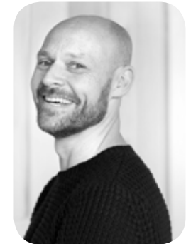
Paul Gerrard Brand Communications